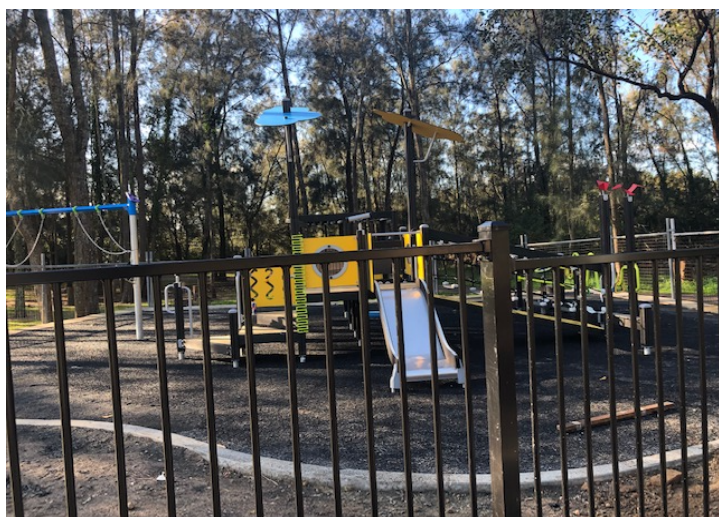
Fagans Park New Childrens Jirrah Ave Playground